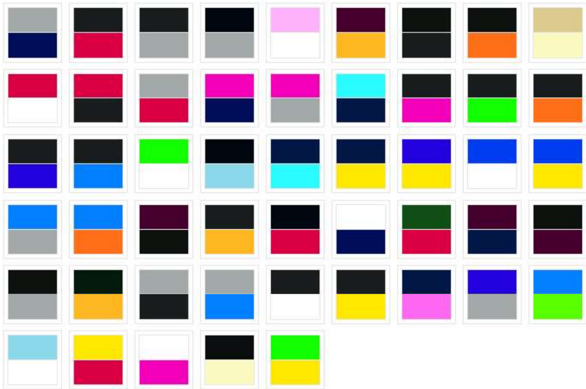
Garment sizes are approximate and for guidance only.